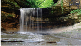
Lasalle Canyon *2.0 mi.