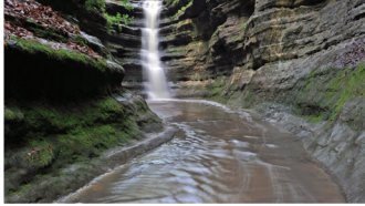
French Canyon *0.4 mi.