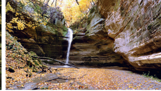
Ottawa Canyon *4.0 mi.