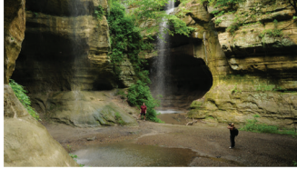
Tonty Canyon *1.9 mi.