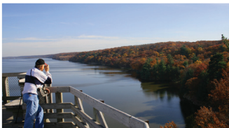
Eagle Cliff Overlook *0.8 mi.