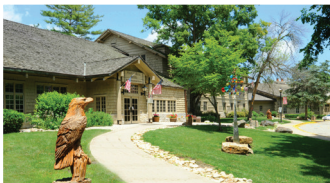
Starved Rock Lodge