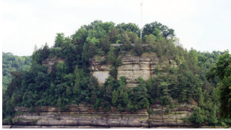
Starved Rock *0.3 mi.