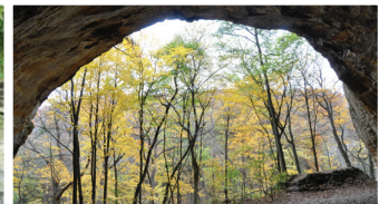
Council Overhang *3.9 mi.

*Length of Trails - All distances are measured one way from the Visitors Center.